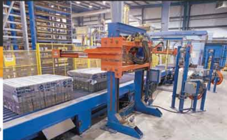
Horizontal and Vertical Strappers with M100 heads and automatic top sheet dispenser.