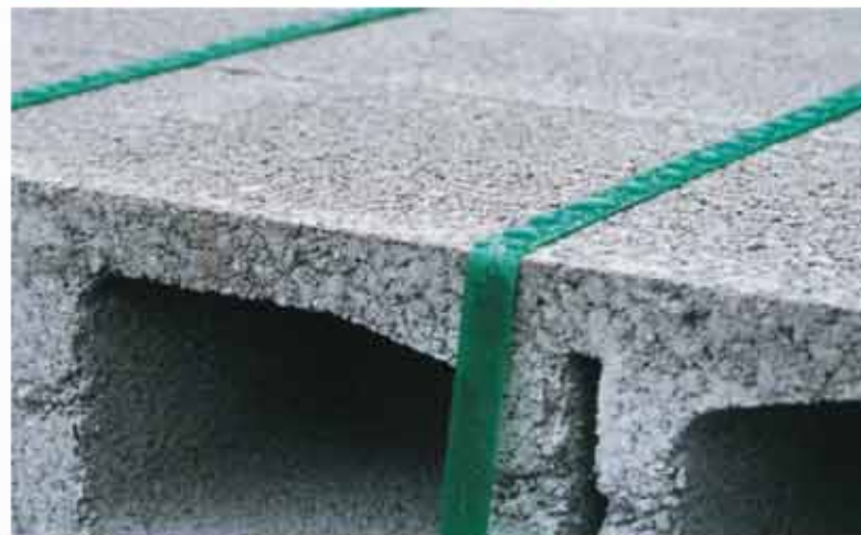
Polyester strapping in application with concrete blocks.