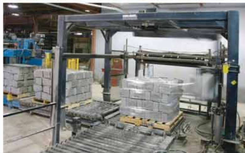
Samuel SRA 650 Rotary Arm Stretch Wrapper with top sheet dispenser.