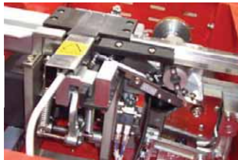
P205 Heavy Duty Seal Engine