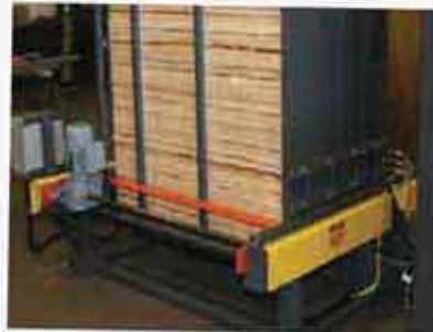
Multiple magazine bunk dispensers