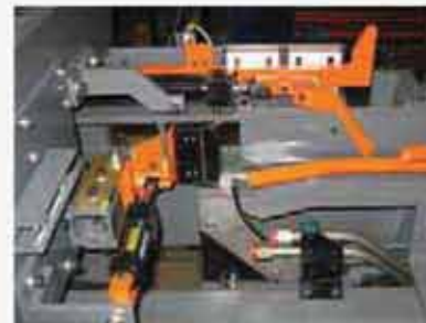
Independent bunk locator