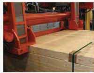
Automatic top and bottom edge protection using flat fibreboard protectors