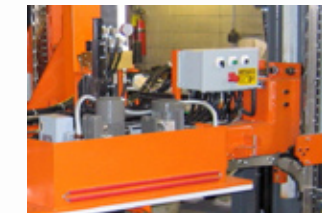
Standard VK-30 head shown for polyester strapping applications