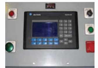
Operator's console with service lockout (shown with optional AB HMI)