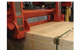
Automatic top and bottom edge protection using flat fibreboard edge protectors