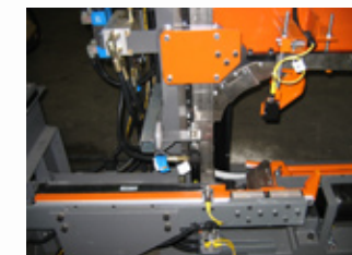
Telescopic strap track & independent bunk locator