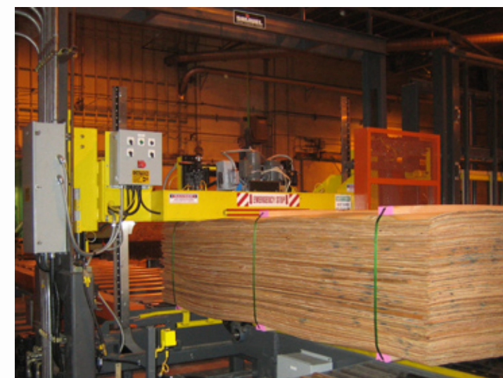
SLP-10 VE Model shown for veneer applications