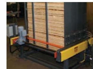
Multiple magazine bunk dispensers