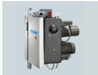
Model VK 30 Polyester Strapping Head