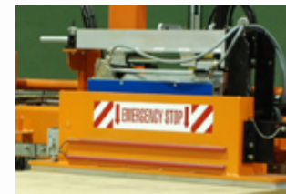
MH-600 head shown for super heavy duty polyester strapping applications