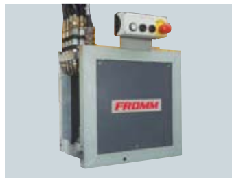
M100 Steel Strapping Head