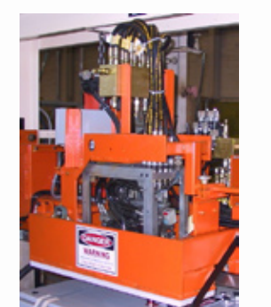
Optional M100 head shown for steel strapping applications